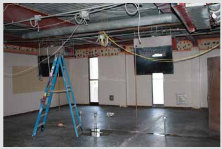
The department's main office (Jones Physical Science Center, PSC 404) stripped of asbestos and ready for renovation

The Jones Physical Science Center was completed in 1967 as a state-of-the-art physical science facility to house the Department of Physics and Astronomy, the Department of Chemistry, the USC Science Library, and the newly purchased USC IBM mainframe computer. In the intervening years, chemistry has moved on to be headquartered in their own building (GSRC), the various separate disciplinary libraries have been combined into the Thomas Cooper Library, and computer technology has made the mainframe essentially obsolete. Only the Department of Physics and Astronomy has really bonded with Jones PSC and found it to be a mostly loving and nurturing home for the past 40+ years. But as with all homes that are occupied for a length of time, there have been highs and lows.